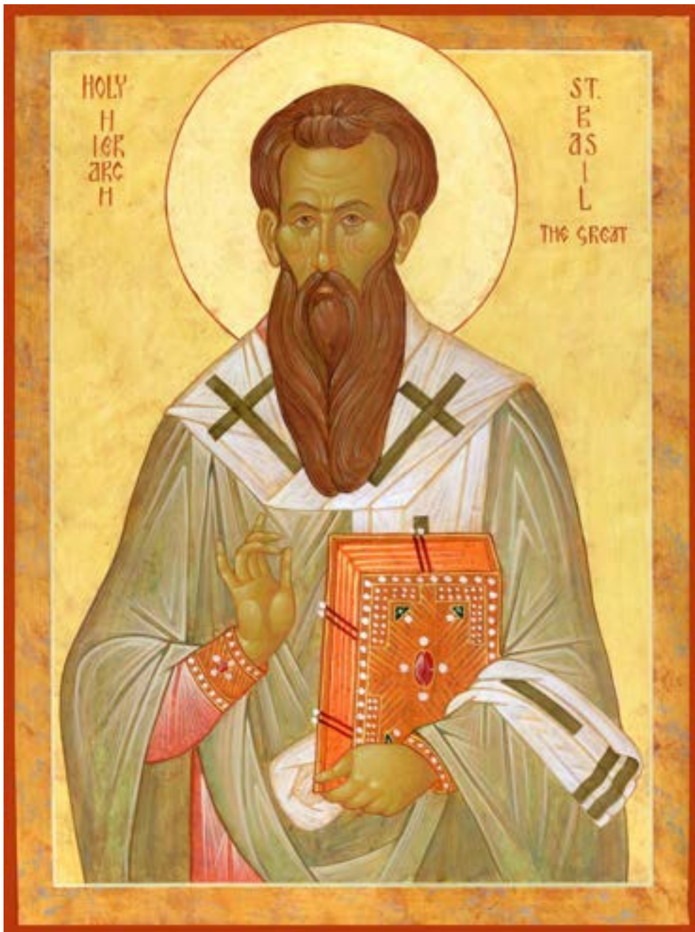
Saint Basil the Great Commemorated January 1st