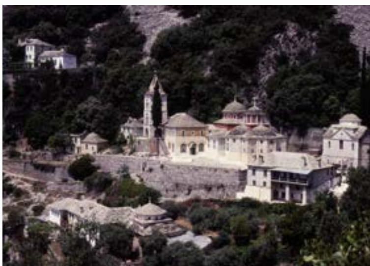
Skete of Kafsokalyvia on Mount Athos named for Saint Maximos