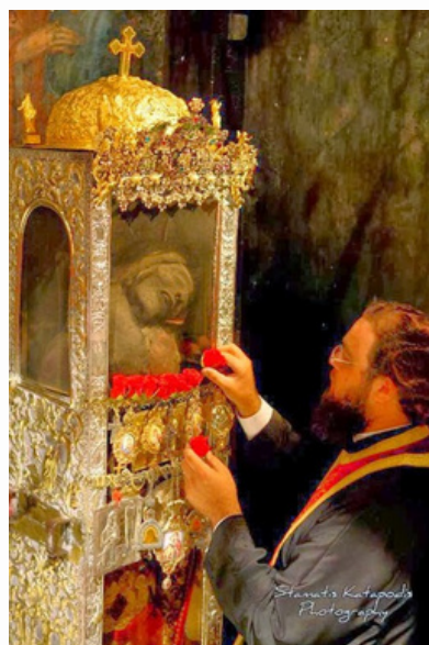
The relics of St. Spyridon in Corfu, Greece