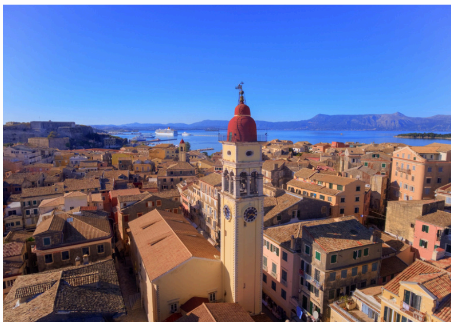
St. Spyridon Church in Corfu, Greece