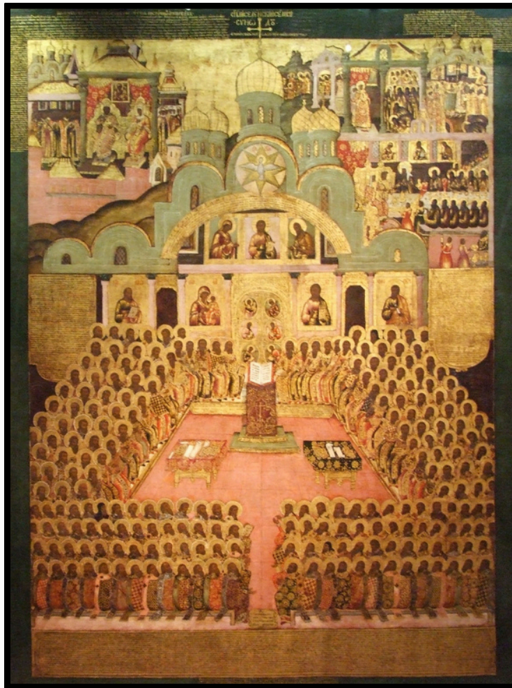
OCT 13 - COMMEMORATION OF THE HOLY FATHERS OF THE SEVENTH ECUMENICAL COUNCIL